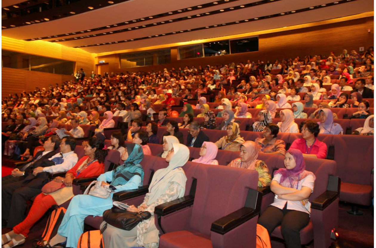
A peek at the Main Scientific Session