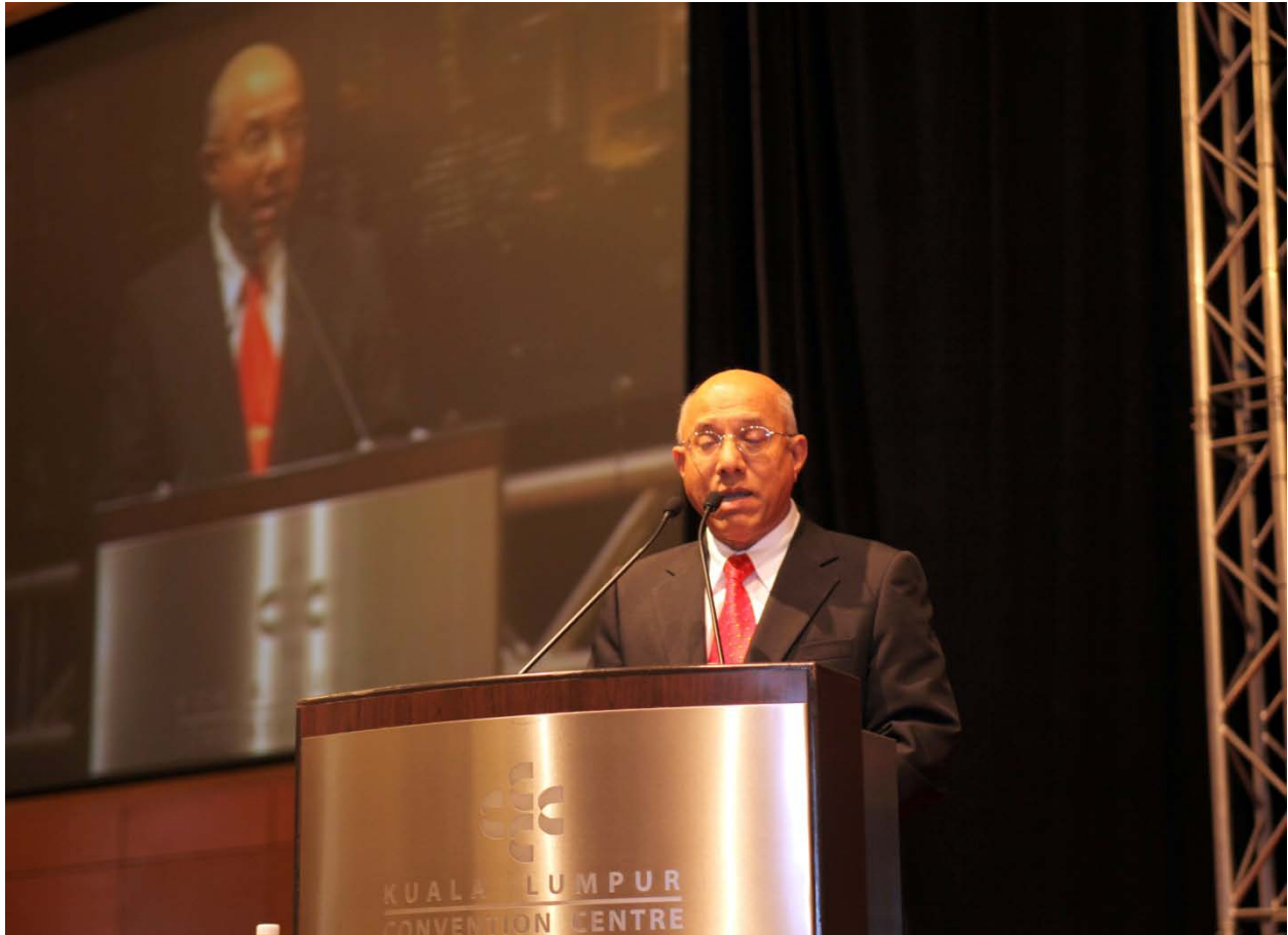
Keynote speech addressed by the Secretary General of the Ministry of Health Dato' Seri Mohd Nassir during the 1 Malaysia Gala Banquet; The dinner was attended by about 500 local and international delegates