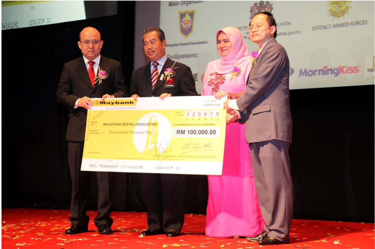
MDA received RM100, 000 donation from the MDA Foundation for the Building Fund