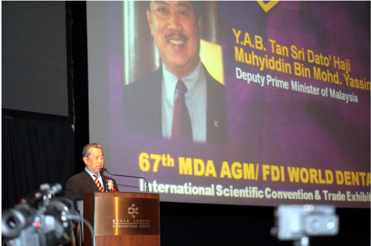
Dental Health Policy speech unveiled by Deputy Prime Minister YAB Tan Sri Muhyiddin during the Grand Opening Ceremony