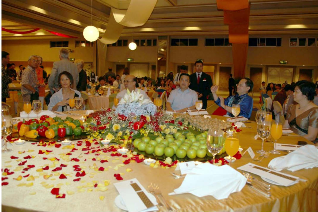
Dental Glee Nite – a dental family union night graced by Honorable Minister of Health Dato' Sri Liow Tiong Lai. The Dinner was attended by more than 500 dentists with spectacular performances from the dental students