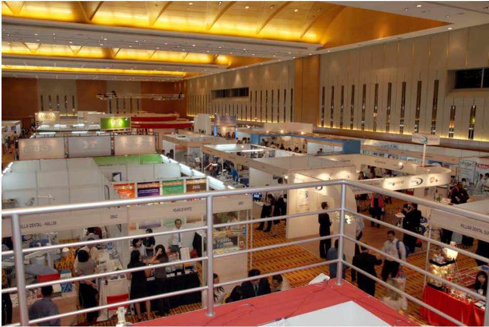
Trade Exhibition Hall – about 200 booths exhibited by more than 100 local and international companies participated in one of the largest dental trade exhibition in Asia Pacific region