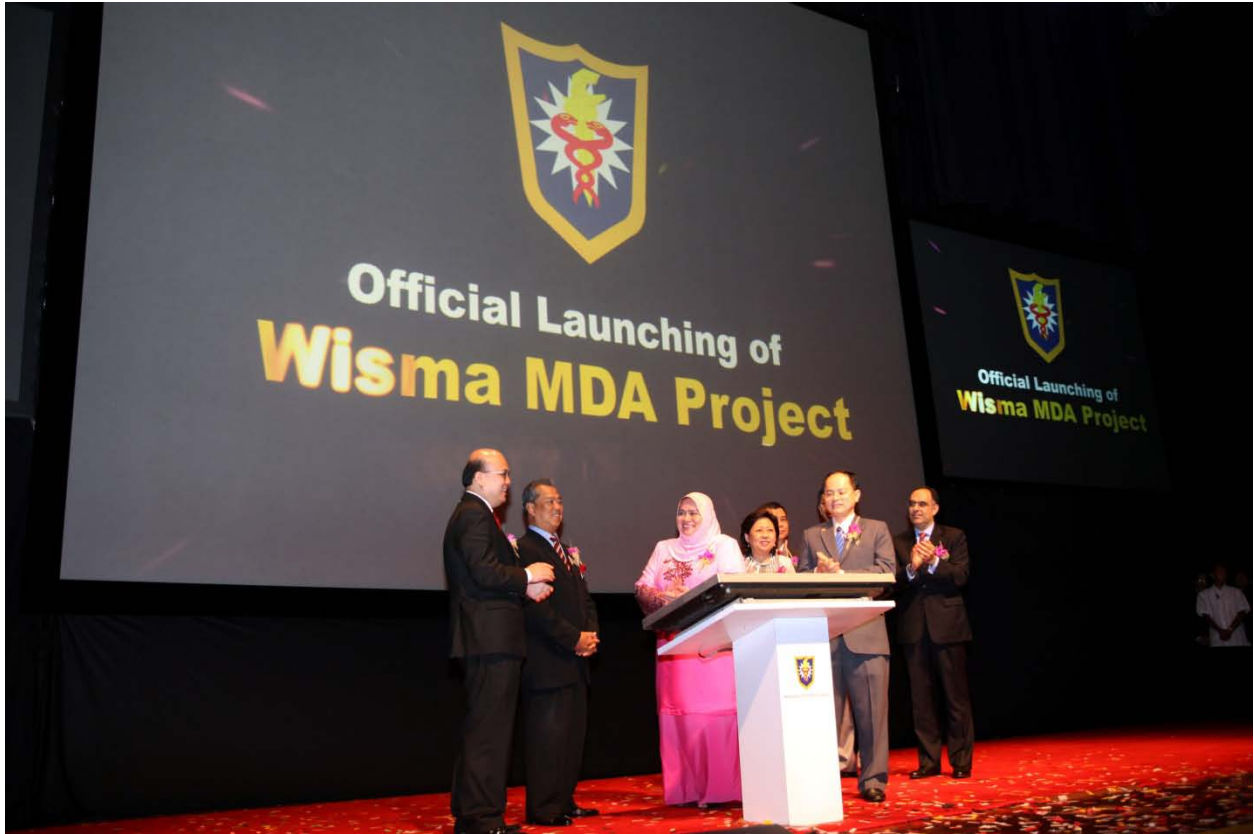
Official Launch of Wisma MDA Project