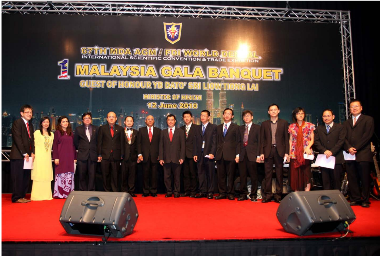
The new MDA Council officially sworn in on 12 June 2010