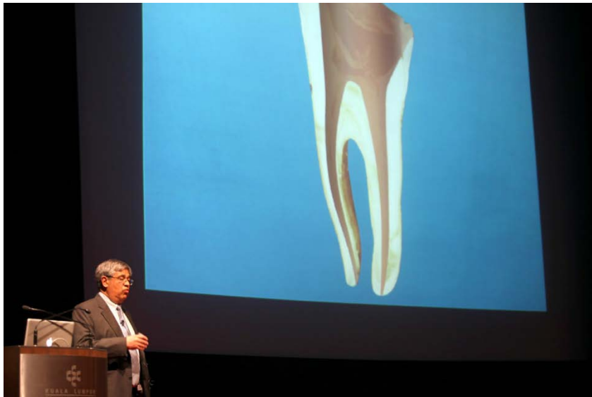
Main Scientific Session with state of the art facilities