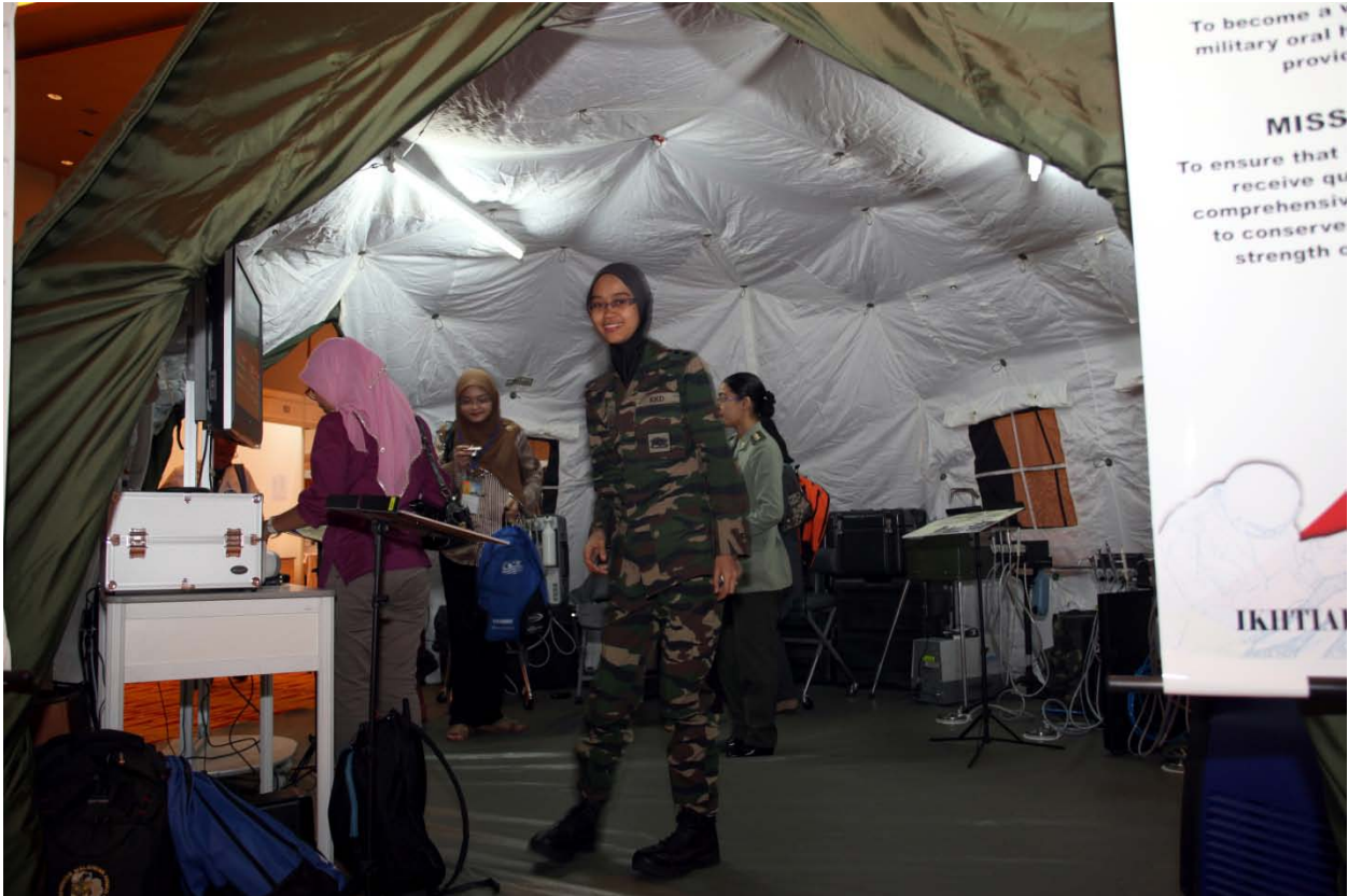
Army Tent for provision of mobile dental service in display at the Trade Exhibition