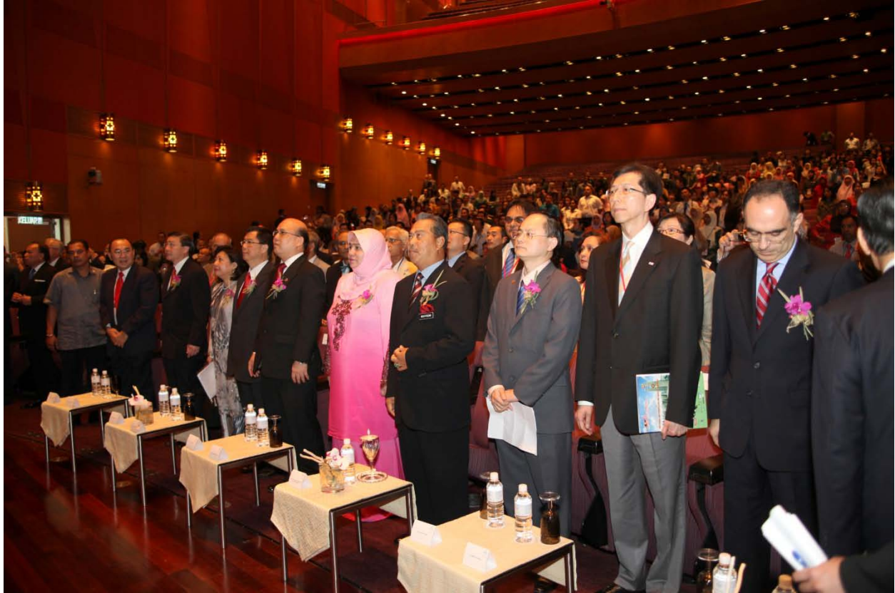
Grand Opening Ceremony officiated by Deputy Prime Minister of Malaysia YAB Tan Sri Muhyiddin This was attended by more than 2000 delegates. One of the grandest highlights of the Convention.