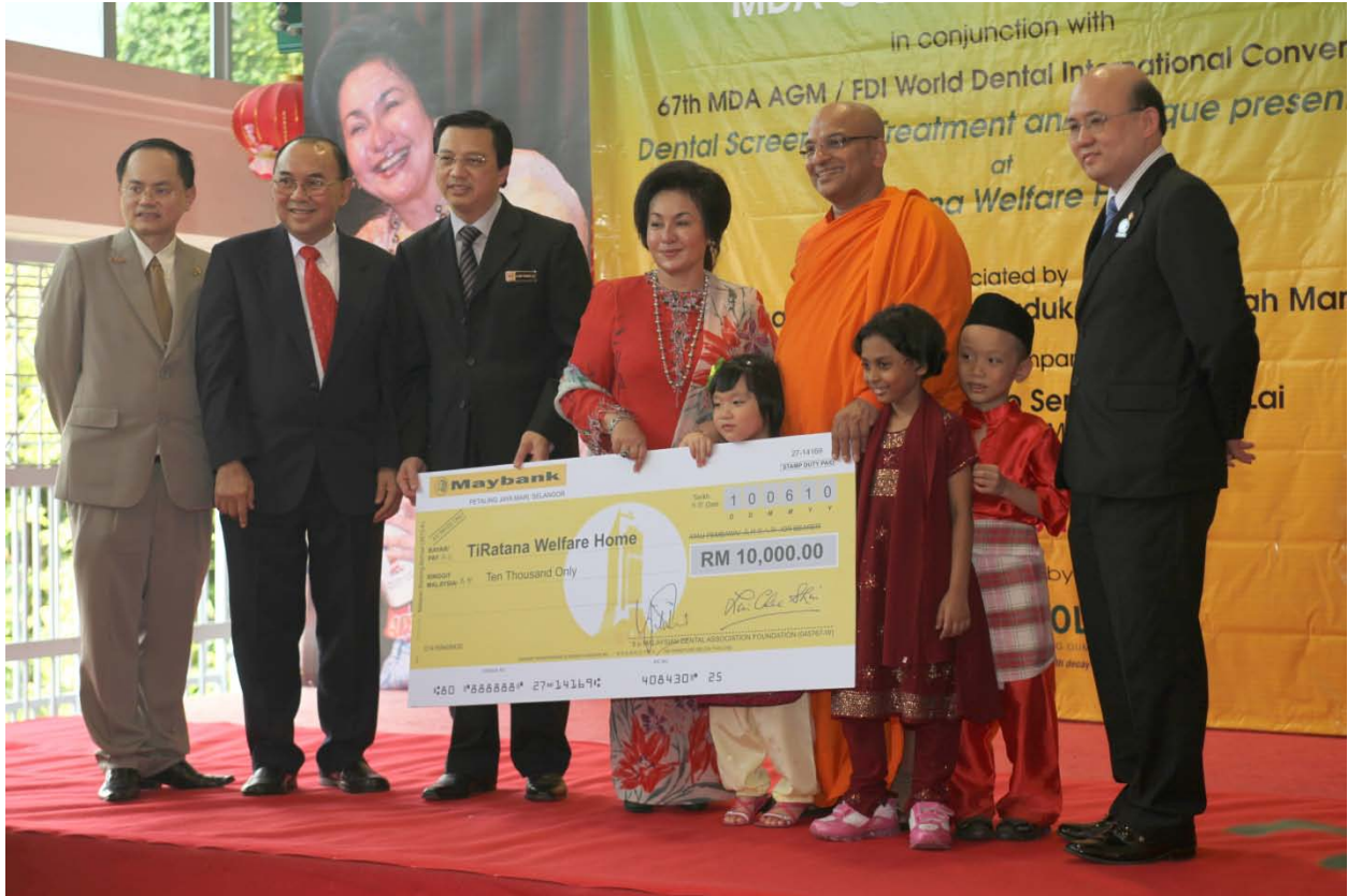
Donation of RM10,000 to TiRatana Welfare Home